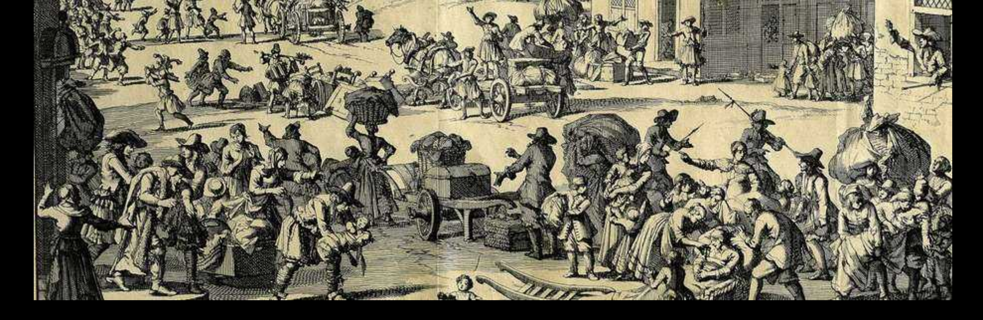
French Huguenots – Week of August 24, 1572 100,000 Martyred in France